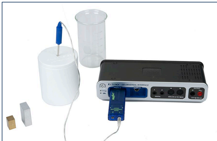
Figure 1: Equipment

In this activity you will use a temperature sensor to measure the temperature change of a volume of warm water when a cold piece of metal is placed in it. Your data will be used to determine the total amount of heat transferred from the warmer water to the cold metal, which will in turn be used to determine the specific heat of the metal sample.