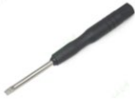
Mini Flat Blade Screwdriver

Recommended Equipment: (PS-3299; Battery Replacement Tool Set) Note: Does not contain a mini flat blade screwdriver.