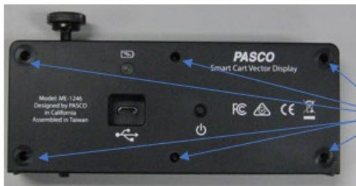
Torx T5 Screw, 6 PLCS

Step 2: Unscrew and remove 6 Screws with the Torx T5 Screwdriver.