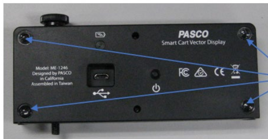
Rubber Feet 4 PLCS

Step 1: Use a mini flat blade screwdriver to pry off and remove the Qty=4 rubber feet. Place on a non-stick surface for later reassembly.