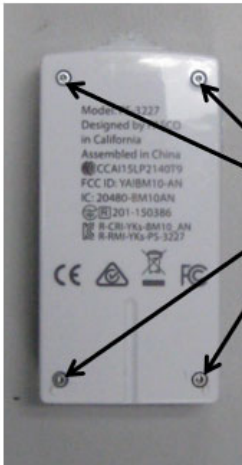
Torx T5 Screw, 4 Places

Step 1: Position the Sensor on a surface as shown. Note the location of the (4) Torx T5 Screws.